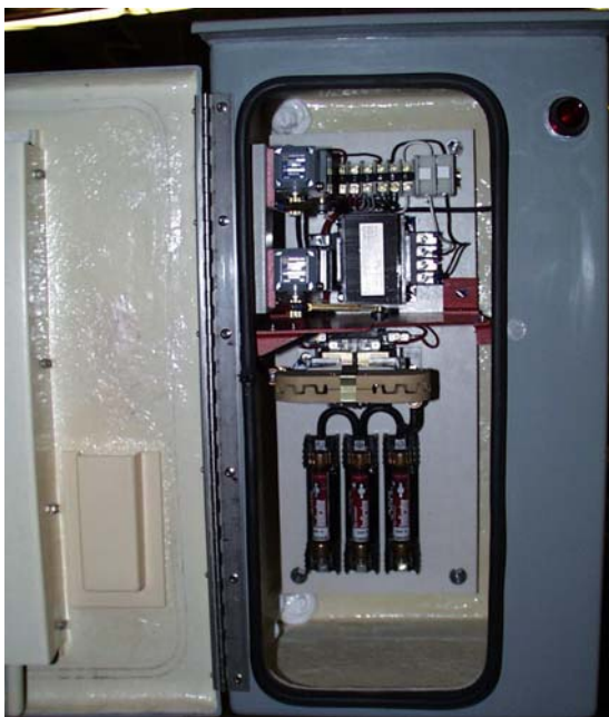
#050526 600 VDC Switch Heater Control Unit With 3 Load Fuses Used by CTA