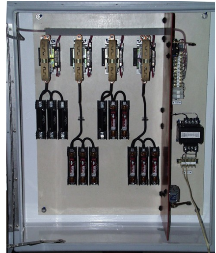
#050528 600 VDC Switch Heater Control Unit With 12 Load Fuses Also available #050529 9 Load Fuses; #050527 6 Load Fuses Used By CTA