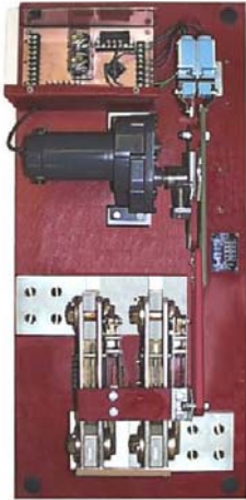
4000 AMP 1000 VDC MOTOR OPERATED TRACTION POWER DISCONNECT FOR MOUNTING IN POWERSWITCH ENCLOSURE OR CUSTOMERS SWITCHGEAR