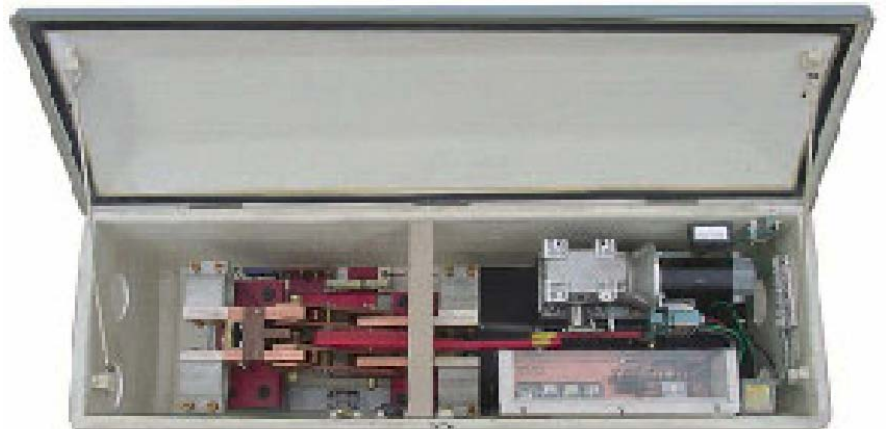
4500 AMP 750 VOLT DC MOTOR OPERATED TRACTION POWER DISCONNECT FOR HORIZONTAL TRACK SIDE MOUNTING

POWERSWITCH Motor Operated Traction Power Disconnect Switches are custom made in accord with specific contract specifications. Shown here are some examples of assemblies similar to as supplied for new facilities at DALLAS AREA RAPID TRANSIT, JFK AIRPORT, ST. LOUIS METROLINK, LIRR, PATCO and METRO-NORTH COMMUTER RAILROAD