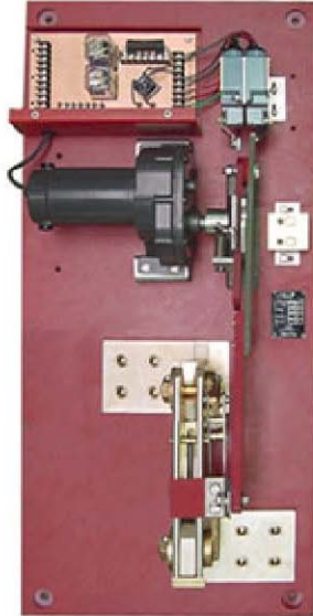
2000 AMP 1000 VDC MOTOR OPERATED TRACTION POWER DISCONNECT FOR MOUNTING IN POWERSWITCH ENCLOSURE OR CUSTOMERS SWITCHGEAR