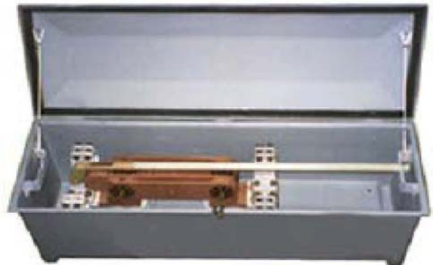
4500 AMP 750 VOLT PULLSTICK OPERATED TRACTION POWER DISCONNECT FOR HORIZONTAL TRACK SIDE MOUNTING

POWERSWITCH Fiberglass Enclosed 600-1000 volt DC Traction Power Disconnect Switches are custom made in accord with specific contract specifications. Shown here are some examples of assemblies supplied for new and revamped facilities at MBTA, ST. LOUIS METROLINK, LIRR, SALT LAKE CITY, AND MINNESOTA HIAWATHA LRT