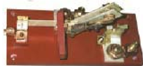
600 AMP 1000 VDC DISCONNECT WITH AUXILIARY BLADE TO GROUND LOAD TERMINAL IN THE OPEN POSITION FOR ENCLOSED EXTERNAL HANDLE OR HOOKSTICK OPERATION