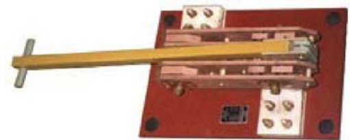
4000 AMP 1000 VDC TRACTION POWER DISCONNECT WITH WAGON HANDLE FOR ENCLOSED VERTICAL MOUNTING

POWERSWITCH Craftsmen combine many years experience machining and fabrication non-ferrous metals (bus-bar copper, silver, brass, bronze, aluminum and insulating materials, (porcelain, fiberglass, plastic) together with the most modern machinery to make the quality assemblies pictured here and on the following pages