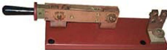
1200 AMP, 750 VDC, SPDT BAT HANDLE OPERATED TRACTION POWER DISCONNECT