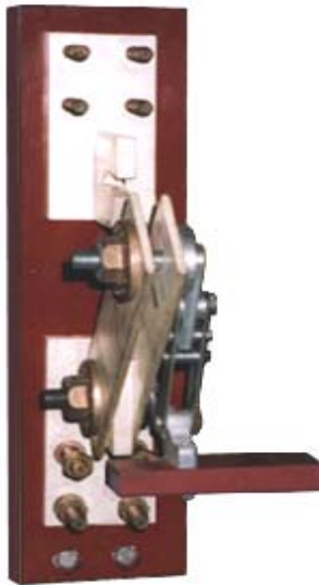
1000 AMP 1000 VDC DISCONNECT FOR ENCLOSED EXTERNAL HANDLE OR HOOKSTICK OPERATION